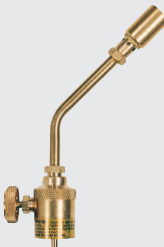
GP-9 HEAVY DUTY TORCH Propane / MAP-Pro™