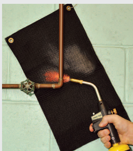
MP-21 FLAME SHIELD