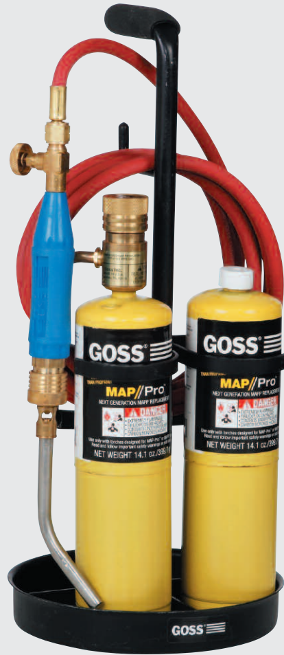
KP-26 Kit, with Stand