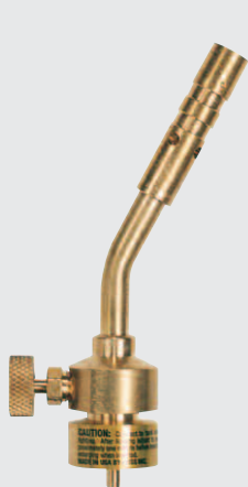
GP-6 ECONOMY TORCH Propane Only